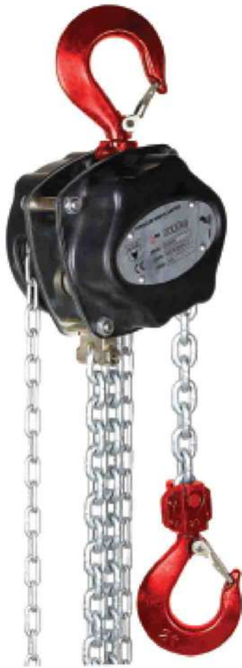
Stier S PRO CPB