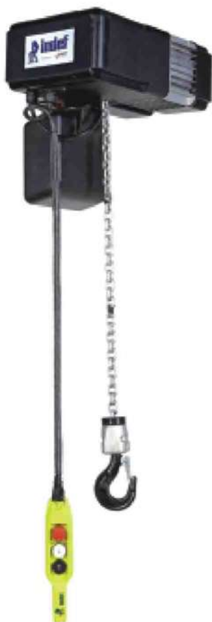
GC Series Electric Chain Hoist