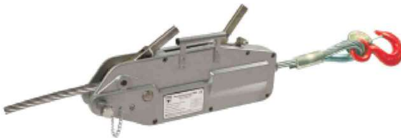
Stier Pulling & Lifting Machine