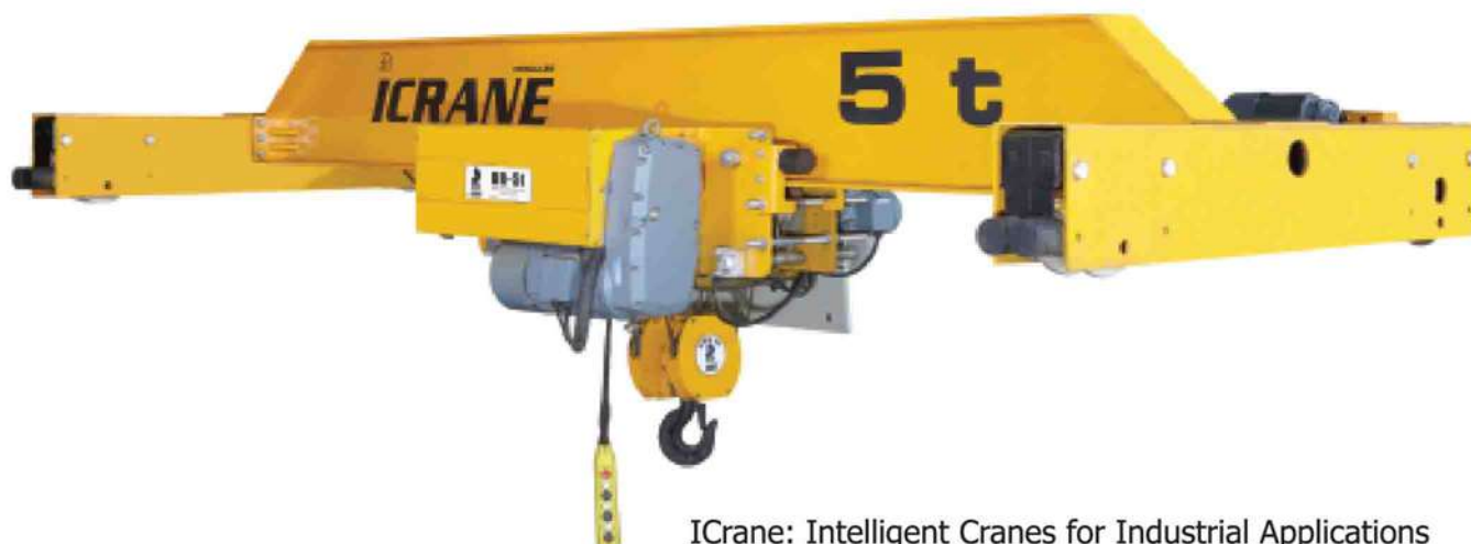
ICrane: Intelligent Cranes for Industrial Applications