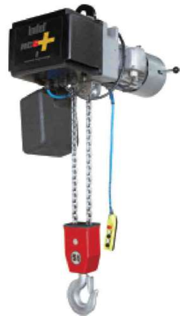
HC 6+ Electric Chain Hoist