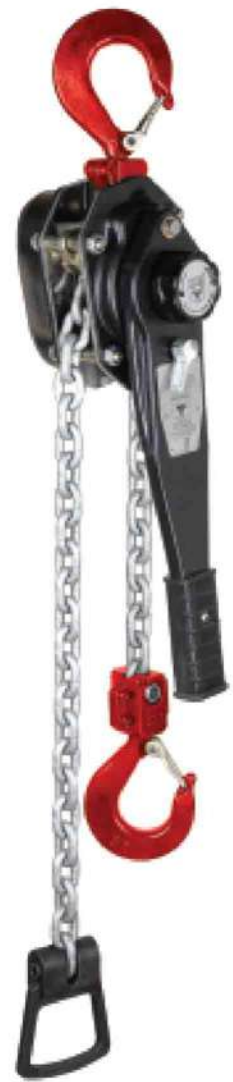
Stier S PRO RLH